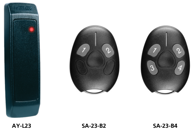
Figure 1: AY-L23 and SA-23-B2/B4